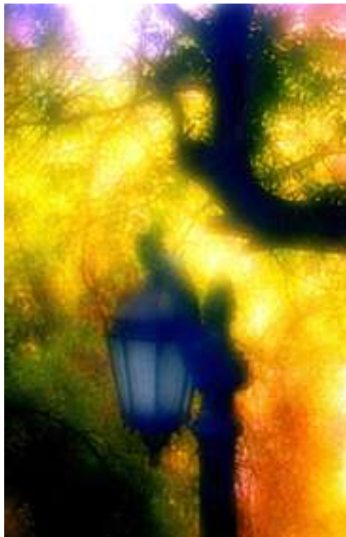
Lampost in Chile